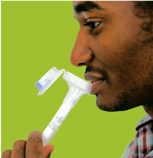
Anthony Nolan is the first register in the world to use saliva testing kits to identify potential donors.

Anthony Nolan manages and recruits donors to the UK's most successful bone marrow register. We have been recruiting potential donors for 36 years, and 2009 saw record numbers joining the register.