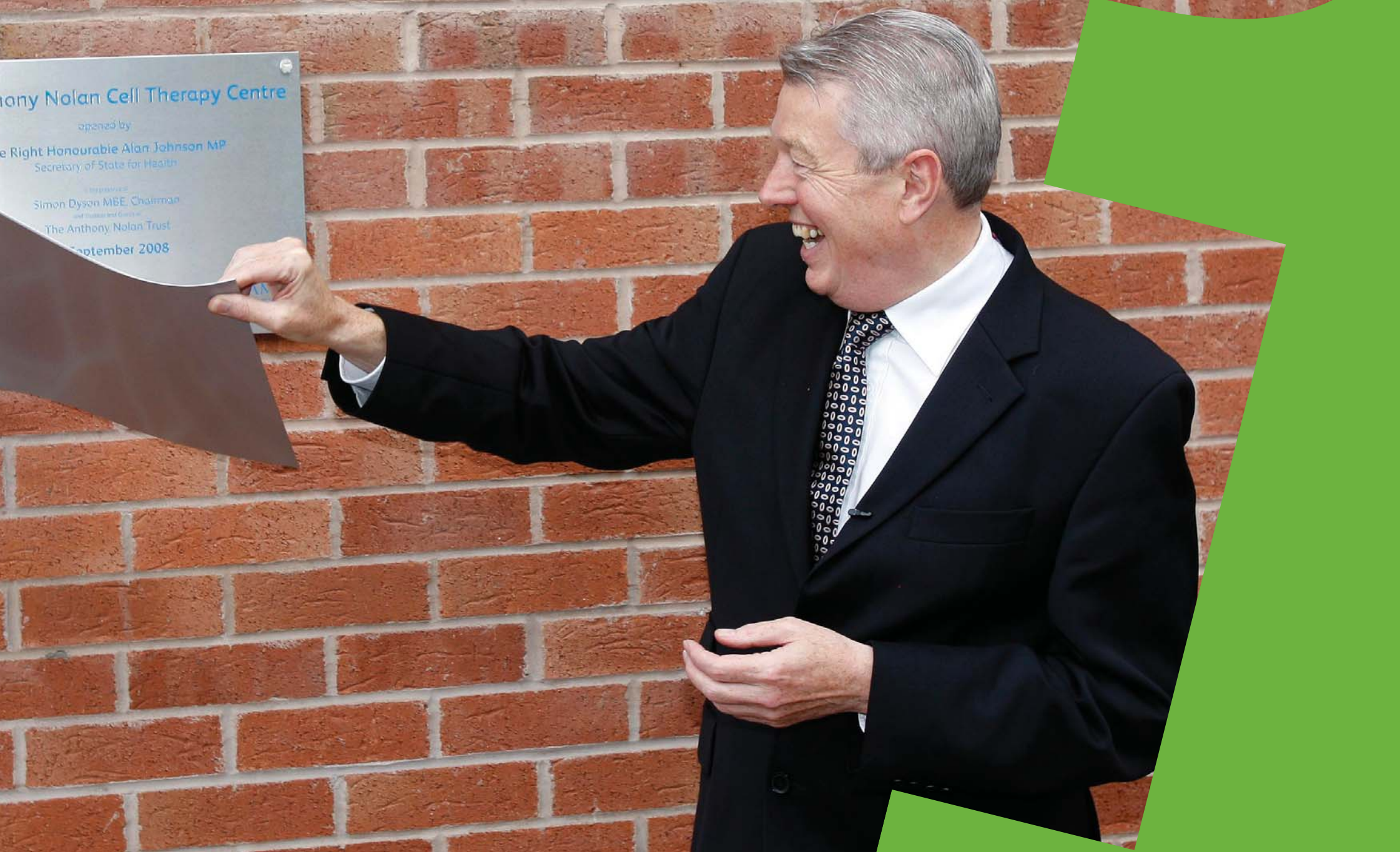
The Rt Hon Alan Johnson MP Secretary of State for Health takes pleasure in opening the Anthony Nolan Cell Therapy Centre, Nottingham Trent University. This marks the setting up of the UK's first charitable cord blood programme – both a cord blood bank and a research institute – which will complement the Anthony Nolan bone marrow register.